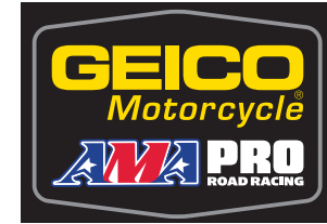
ON DARK BACKGROUNDS