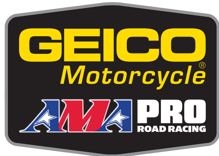
SHIELD DESIGN - FOR DARK BACKGROUND USE

Shield design is the primary logo and should be used for rider suit and crew shirts.